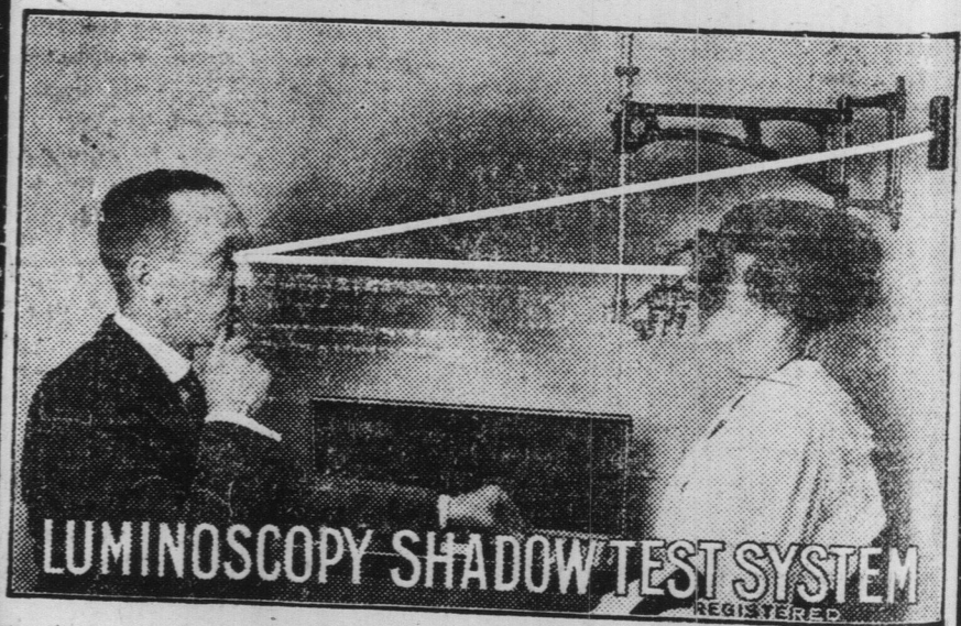
LUMINOSCOPY SHADOW TEST SYSTEM

Is coming for 10 days starting Monday February 24 ending Wednesday, March 5th.