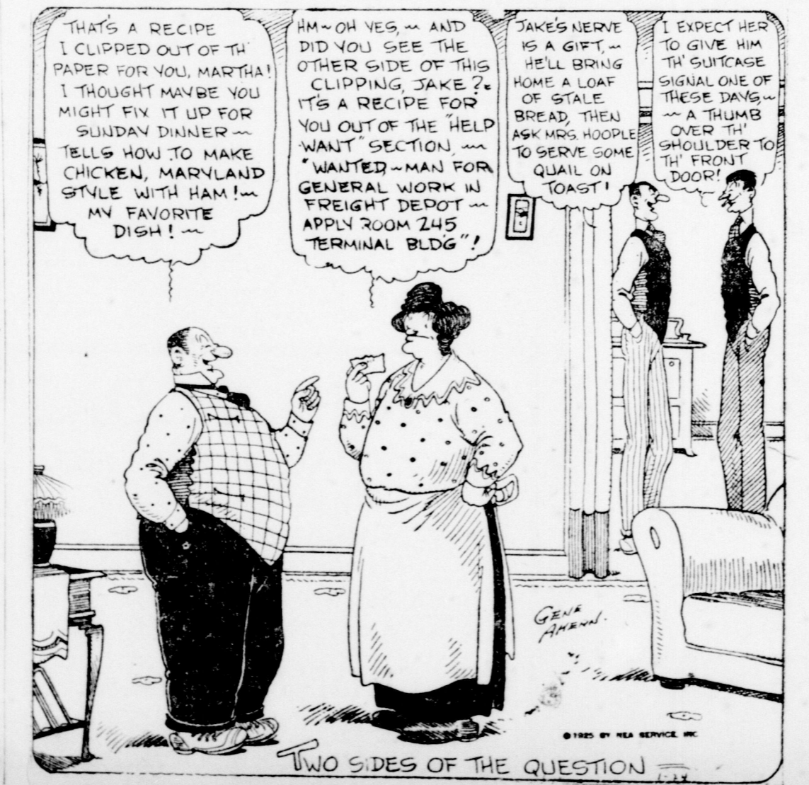
TWO SIDES OF THE QUESTION

Associated Press Despatch. San Francisco, Jan. 23.—Construction of a $1,000,000 baseball park as the home of the San Francisco club of the Pacific coast league became virtually assured when the board of supervisors yesterday granted a petition to close parts of three streets where the park is to be built. The grounds will occupy two square blocks.