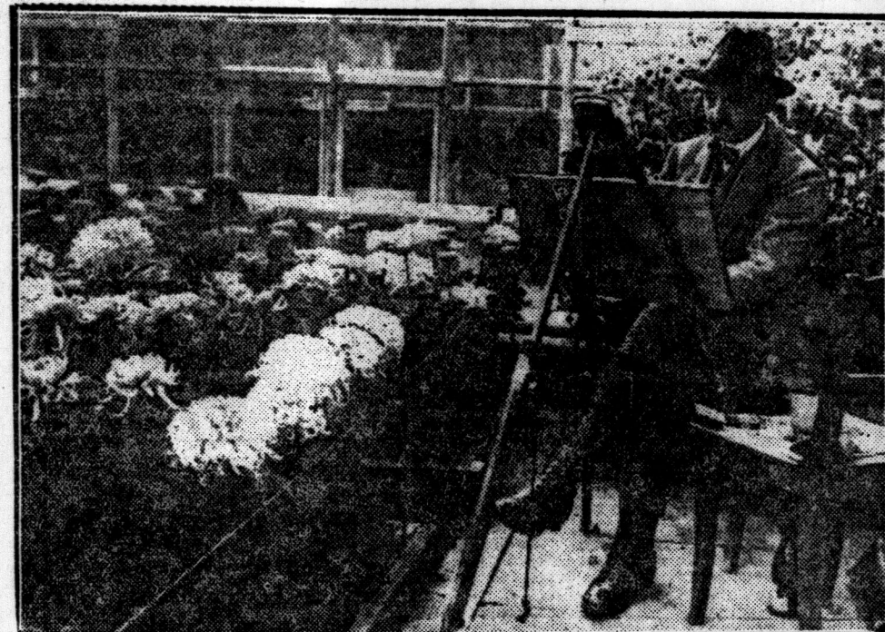
Prince August Wilhelm, third son of the former German emperor, declares that he must actually work to earn a living. His specialty is painting flowers, and he is seen in the greenhouse of his Potsdam home, working