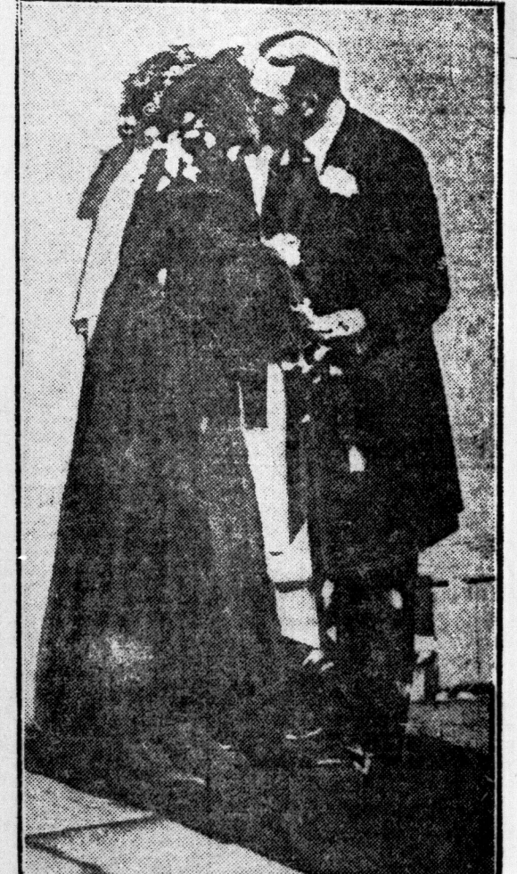
As Lord Carnegie and his bride, Princess Maud, were about to leave their London home for their honeymoon trip, the King of England kissed the bride good-by and wished the couple well