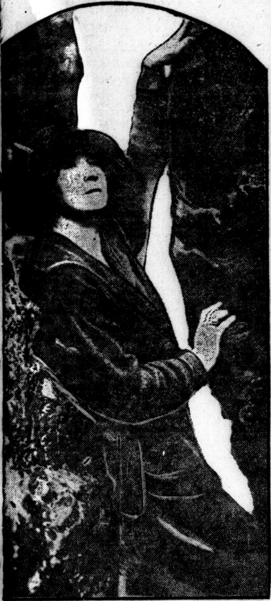
It is the ambition of all climbers who reach the top of the Wrekin, the most famous mountain in Shropshire, to pass through "the eye of the needle." A person has to be thin to enter the narrow passage between the two rocks