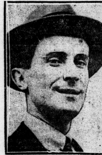
Prince Felix Felixovitch Yousouppoff, who has arrived in America, confesses to the slaying of the Russian monk Rasputin. Prince Felix at one time was one of the most influential young noblemen connected with the Russian court