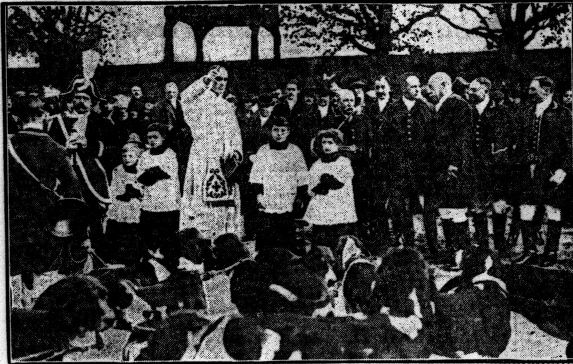
French society and diplomats attended the famous St. Hubert Deer Hunt in the forest of Halath. The photograph shows the hounds of Count de Valliere being blessed before hunting for the deer