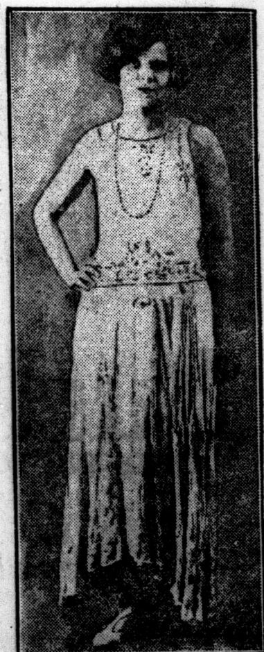
Here is an unusual evening gown of white, which is elaborately embroidered in yellow. Note that the skirt on the sides is longer and fuller than either the front or back