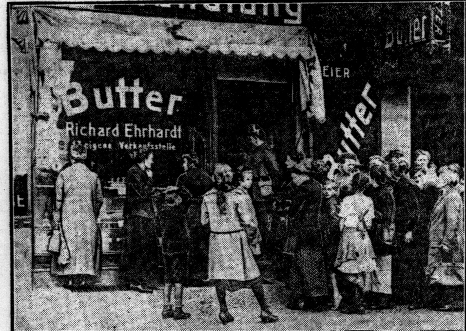
With an armed guard standing on the threshold, the German butter shopkeepers feel assured that their stock will not be subject to a raid by the hungry crowd that gathers at the door