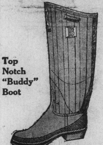
Top Notch "Buddy" Boot

A. B. LEHR, The Senior Dentist, 203 WATER STREET.