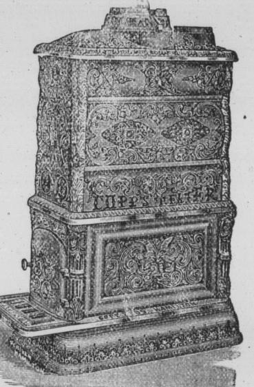
COPP'S WARRIOR HEATER. The most beautiful, economical, powerful hot air wood heater ever invented; suitable for dwellings, stores and churches. Sold by leading dealers. Write for descriptive circulars to the manufacturers, the COPP BROS., Co., (Limited), Hamilton, Ont.

The craze for stage realism met a check when "Held by the Enemy" was staged. The women declined to wear the balloon hoops of the period, and would not hear to adopting the chignon.