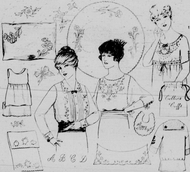
The above Illustration shows a few of the Designs in Outfit

The Set consists of the following Patterns: