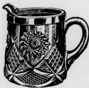
No. 12. Cream-Cut Glass Pattern, Silver-Plated Mounting. Above cut size.