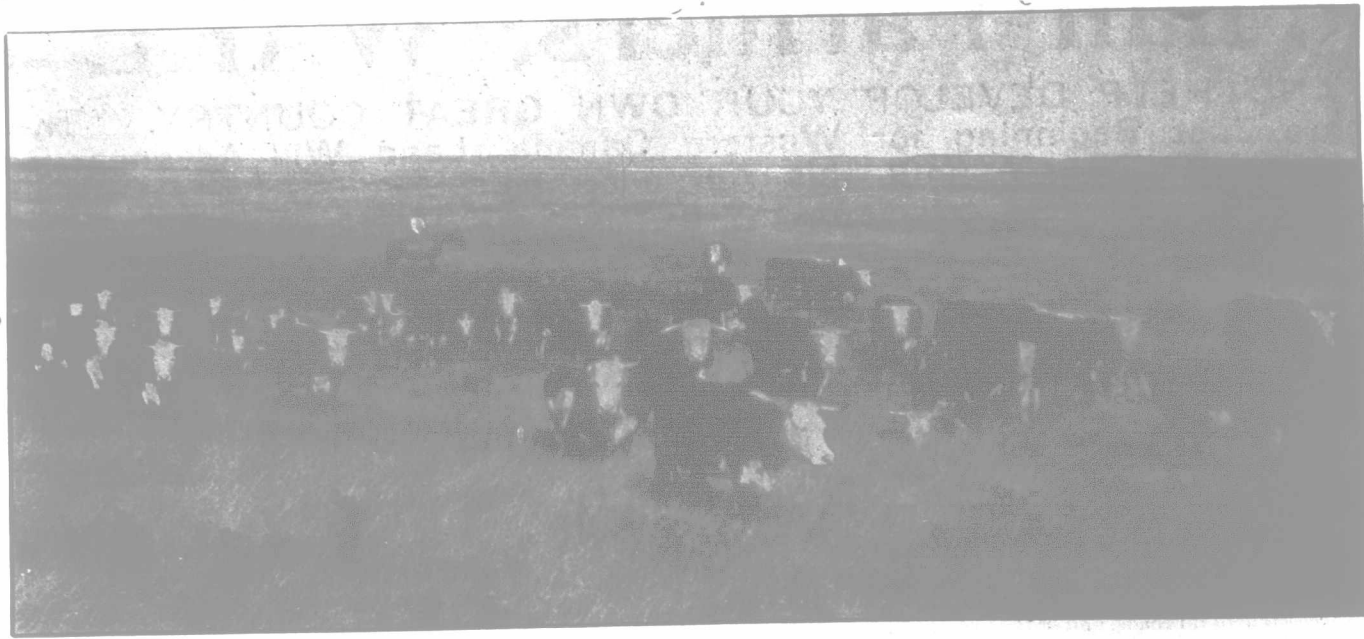
Hereford Cattle, Crane Lake, Assiniboia, Main Line Canadian Pacific Railway.

The Canadian Pacific Railway Company have 12,000,000 acres of choice farming lands for sale in Western Canada. Manitoba and Eastern Assiniboia lands generally from $4 to $10 per acre, according to quality and location. South-western Assiniboia and Southern Alberta lands, $3.50 to $8 per acre. Ranching lands generally $3.50 to $4 per acre. Northern Alberta and Saskatchewan lands generally $6 to $8 per acre.