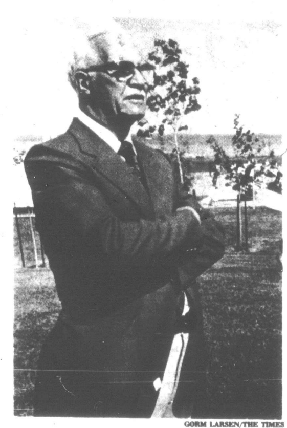
Saddington at Saddington Park