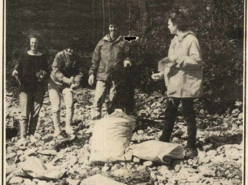
Four different schools converged for Fall Beach Sweep '91, from September 23 to 29.

Halifax's plant, he cautioned that Halifax may, "take care of one problem by building a sewage plant, then create another