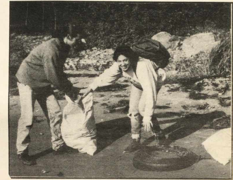
All smiles, the sweepers diligently comb the beach for toilet junk.

Jenkins is also concerned that McNab's Island is a proposed site for Halifax's sewage treatment plant. The plant would be built at the historic north end of the island, actually positioned