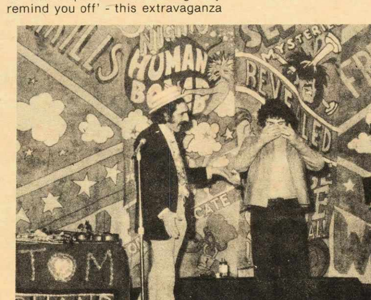
Madhouse Theatre deties description — one simply has to see and survive it.

provided its audience with an experience or two they will never forget (even if they might want to). To do these talented and multifaceted performers justice is impossible for they dety description as does their act. The curious will just have to brave the hairy grasp of the wild man of Borneo, and come and see for themselves at the Theatre's last appearance on Thursday night.