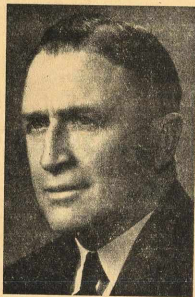
the Allied victory in the past war.