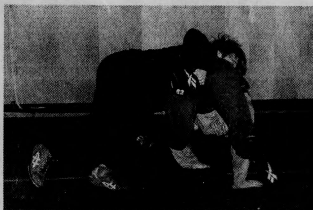
Wrestlers practicing their moves on the competition at CIAU's.

The wrestlers placement in a pool is dependent on a seeding meeting on Thursday night. The seeding is determined by last year's champion and last year's medalists. "We're looking for a good seeding in the pool, for example 1 and 4 would be a good match-up because 4 wouldn't be as strong as 1 but 2 and 3 would be a bad match-up because there isn't much difference