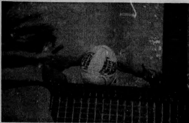
The Reds are zeroing in on the competition at the CIAU's.