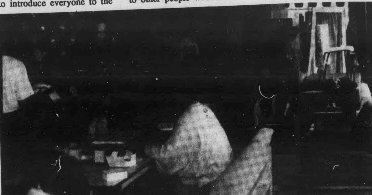
Increasing Awareness - Groups and organizations had a busy two days during Student Activity Days.

These goals have obviously been achieved at Student Activity Days. The event was a great success and has proven once again to be an exciting and worthwhile part of UNB Orientation.