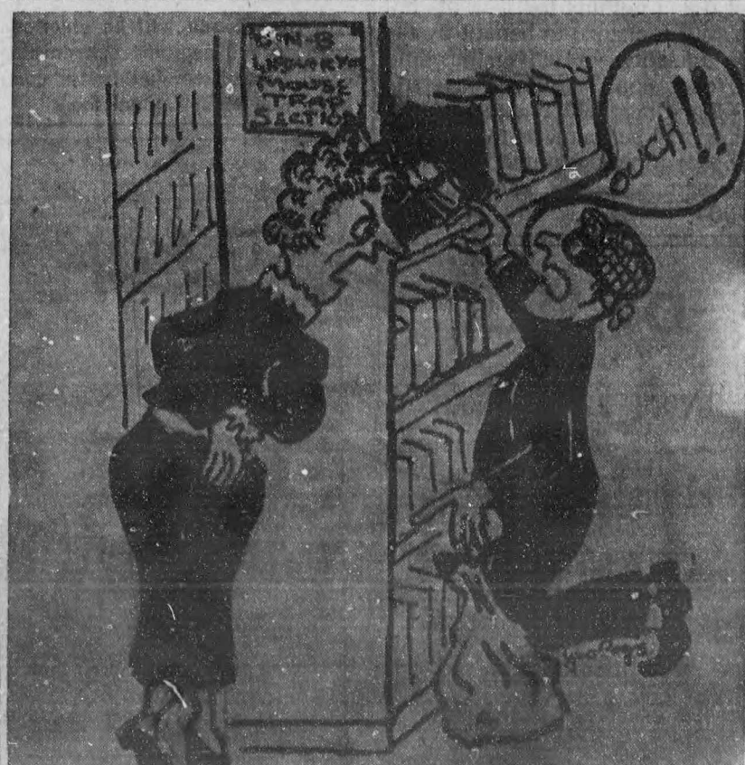
When we say they're closed - We mean they're closed.