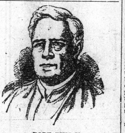
POPE PIUS X. The audience occurred in the pope's library and merely consisted of an exchange of compliments, the pontiff expressing his appreciation of the kindness of Mr. Morgan in visiting him and recalling his visit of last May.