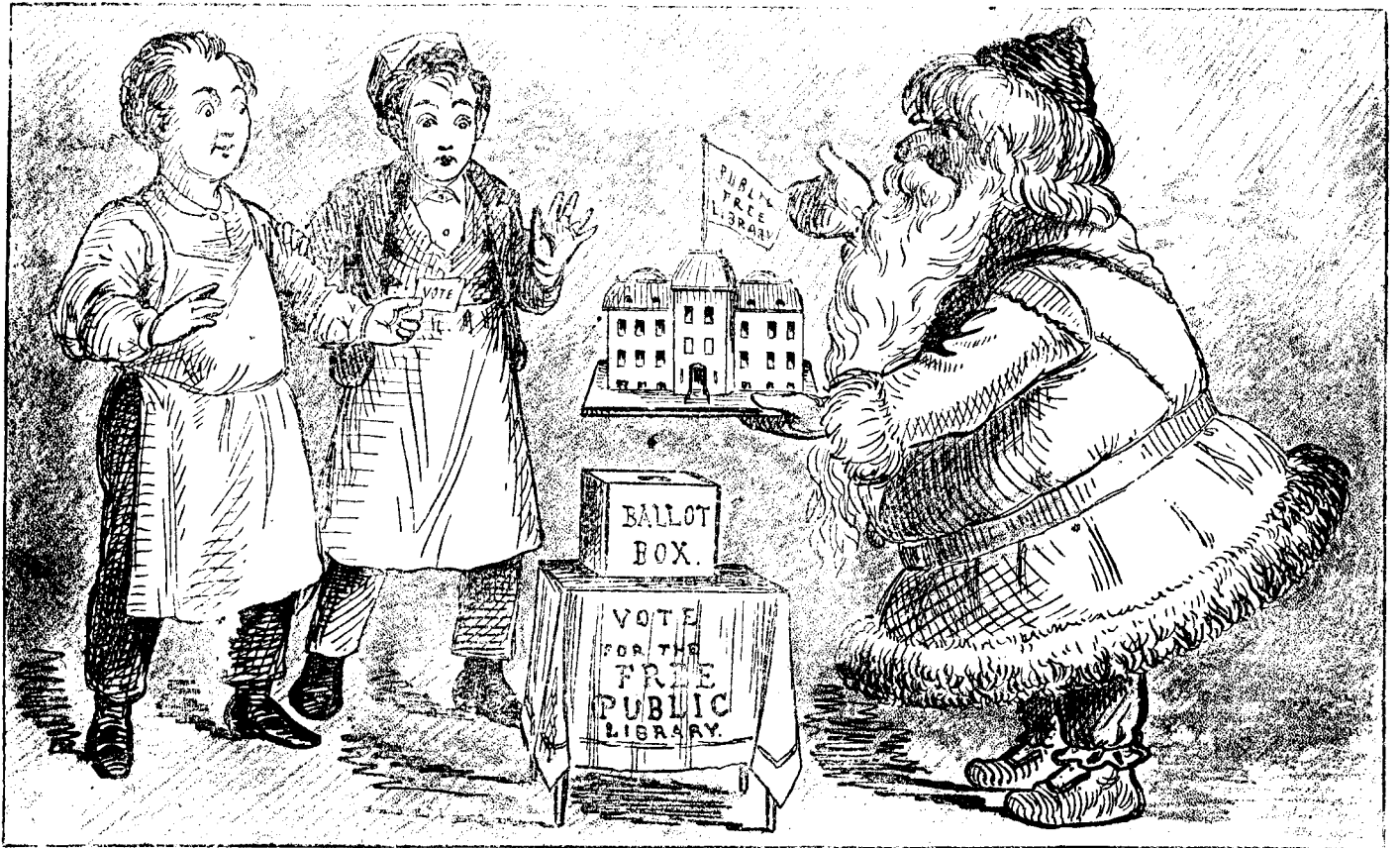
A CHANCE FOR THE SONS OF TOIL.

SANTA CLAUS.—VOTE FOR IT, MY DEARS, AND YOU SHALL HAVE IT.