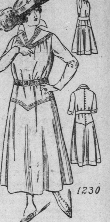
Costume for Misses and Small Women.

This desirable model is easy to develop. It is cut in semi-fitted style with long waist outline, and has a belt which may be omitted. The skirt is a three piece model, and flares in comfortable fullness below the hips. The sleeve may be finished in wrist or short length. The Pattern is cut in 4 sizes: 14, 16, 17 and 18 years. It requires 3 yards of 44 inch material for a 16 year size. The skirt measures about 3 1/3 yards in the 16 year size at its lower edge. A pattern of this illustration mailed to any address on receipt of 10c. in silver or stamps.