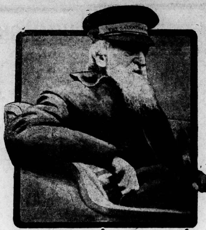
REV. WILLIAM BOOTH. Head of the Salvation Army who is said to be dying.

Special to Evening Telegram. CAPE RACE, To-day. Wind south, strong, heavy rain storm, steamers Gramplan and Laurentic passed outward at 6 last evening; Fiona passed in at 5.30 this morning. Bar, 29.05. Ther. 60.