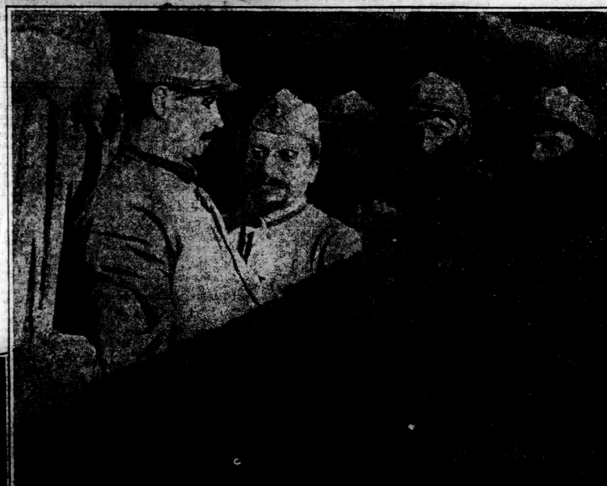
At the entrance to a boyau, or connecting trench. A group of ambulance workers and Red Cross surgeons near Fey-en-Hey, Bois le Pretre, Lorraine. They are a few feet from a dressing station. The boyaus are often tunnels.