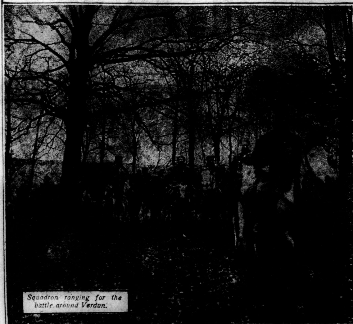
Squadron ranging for the battle around Verdun.