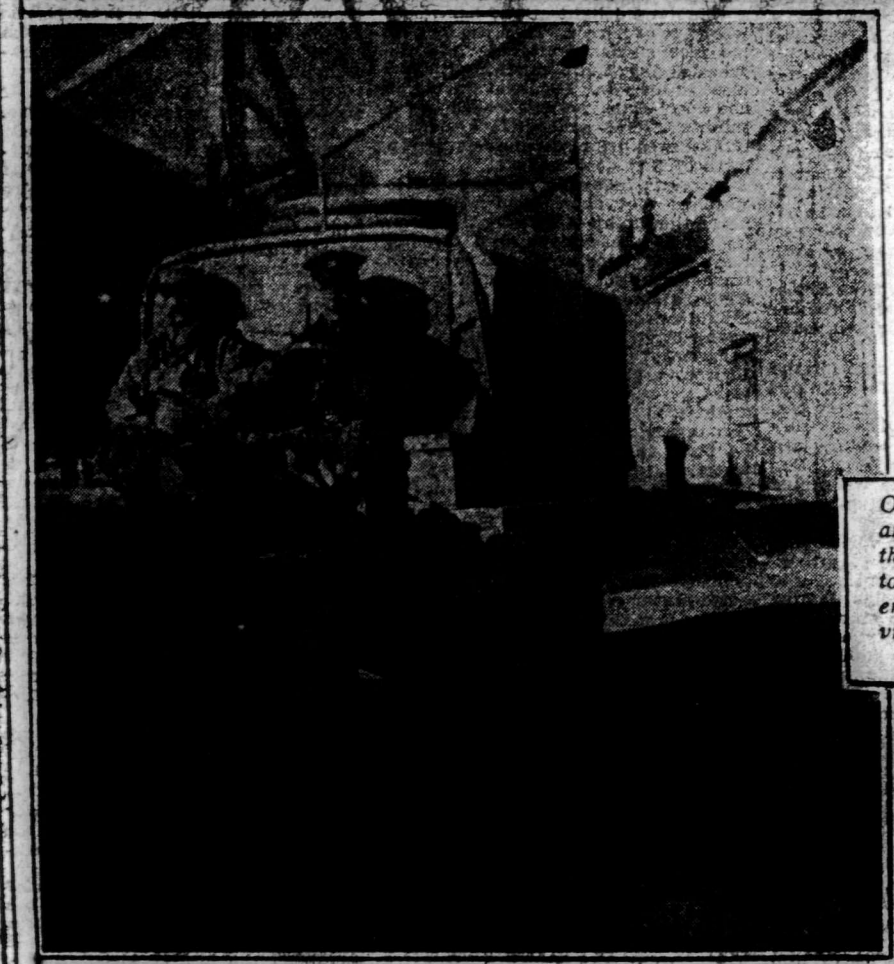
One of the American ambulances being driven through a screen erected to hide troops from the enemy while passing a visible point in a village road.