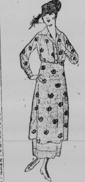
Most attractive is this dress made of a combination of materials. McCall Pattern No. 7983, Ladies' Waist. In 8 sizes, 34 to 48 bust. No. 7969, Ladies' Two or Three-Piece Skirt. In 7 sizes, 27 to 34 waist. Price, 20 cents each.

These patterns may be obtained from your local McCall dealer, or from the McCall Co., 70 Bond St., Toronto, Dept. W.