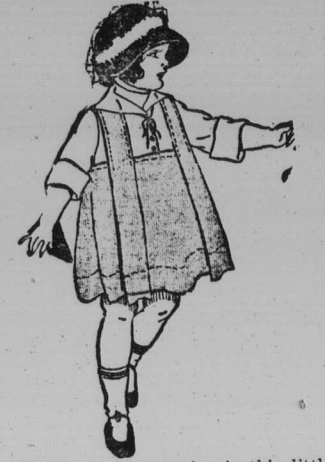
Simple and attractive is this little model. McCall Pattern No. 8068, Child's Dress. In 5 sizes, 2 to 10 years. Price, 15 cents.