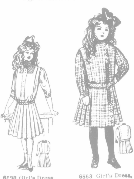
6 to 12 years. 6 to 12 years.