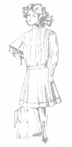
6543 Girl's Tucked Dress, 8 to 14 years.

Patterns ten cents each. State age when ordering. Address: Fashion Dept. The Farmer's Advocate," London, Ont