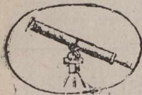
Registered Trade Mark.

Locks in all qualities for Cabinet Makers, Sash Fasteners, Locks & Brassfoundry for Builders' Ironmonger. ALL KINDS OF KEYS MADE on the PREMISES.