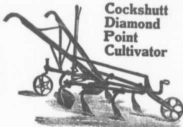
Cockshutt Diamond Point Cultivator

The Cockshutt Diamond Point Cultivator is built with the same care and of the same reliable materials as the Ruby, but is of somewhat heavier construction.