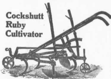
Cockshutt Ruby Cultivator

The Cockshutt Ruby Cultivator is the ideal light weight cultivator for all kinds of work. Its construction is strong and at the same time very simple.