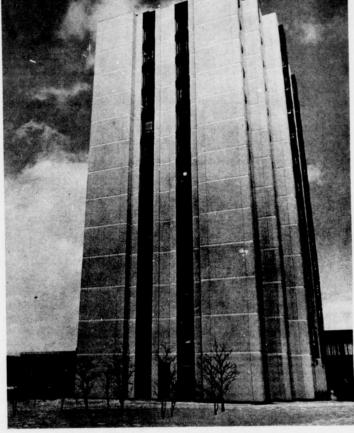
Is this an example of all future residence life?

Residence life is so bad that some students are willing to travel over 109 miles a day just to avoid it