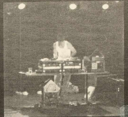
Scratch Bastard in an early round