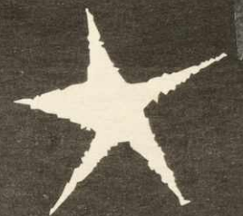
Papa Grand MC