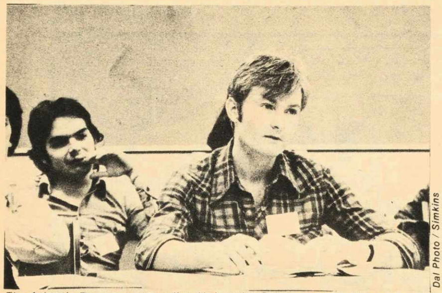
The Atlantic Region of Canadian University Press met over the weekend in Charlottetown. Delegates from 8 Atlantic Universities discussed the future of the organization deciding that re-structuring is necessary to best serve readers in the region. Atlantic papers will recommend to the National Conference at Christmas time that the only staff position in the Atlantic be that of a staff person whose main duty will be to cover news on a regional basis for Atlantic campuses.