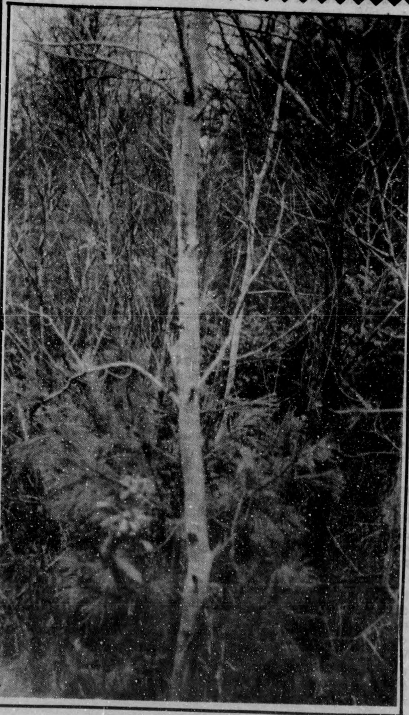
ALYS GIANNAKAKIS Photo