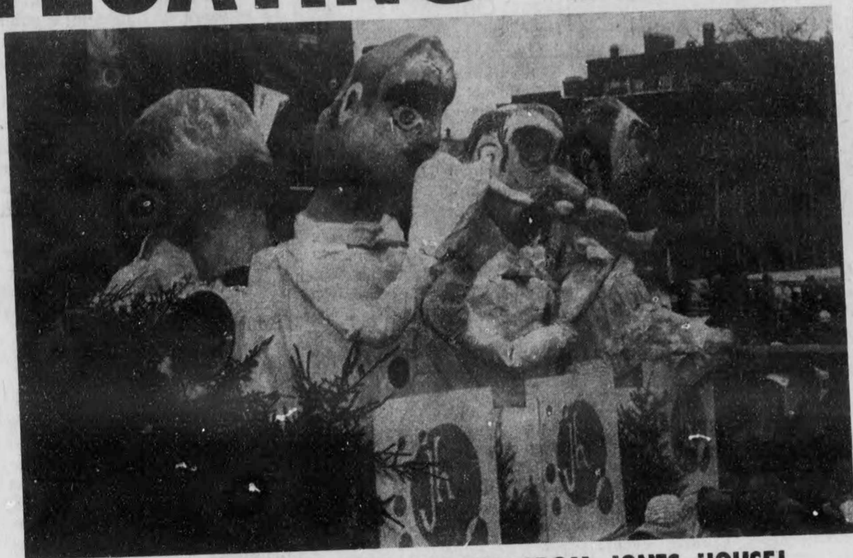
LAST YEAR'S BIG FLOAT WINNER FROM JONES HOUSE!