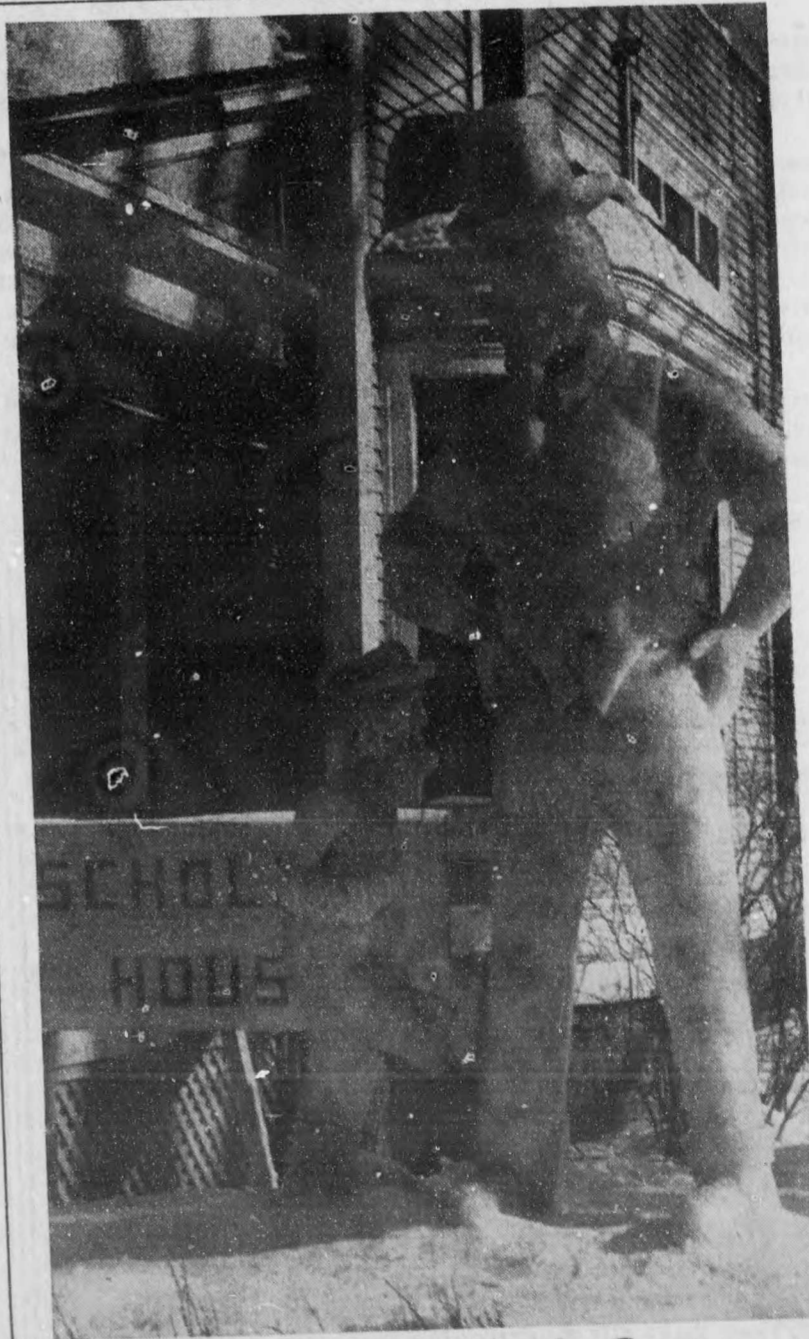
Watch Out, Uncle Sam

Due to the lack of snow some of the residences are working with ice. These parties can only be congratulated for their keenness. Judging by the quality of the ice sculptures snow may become a very rarely used material in the future. The committee sincerely hopes that everyone will join in the fun and lend a helping hand whether it be artistic or otherwise.