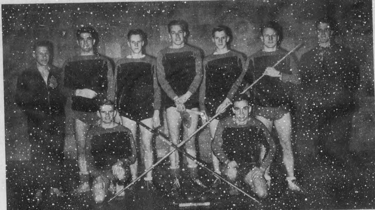
U. N. B. Track Team of Last September's Meet at Dal.

Welcome Hillmen The Princess Grill QUEEN STREET