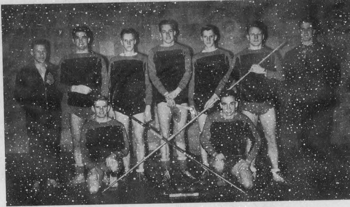
U. N. B. Track Team of Last September's Meet at Dal.