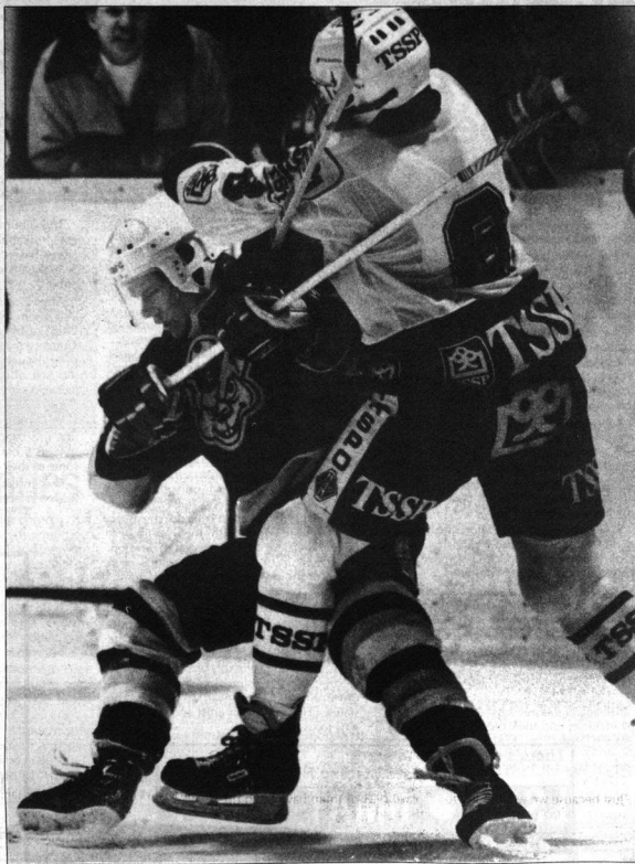
Bear player in tough going in Viking Cup semi-final vs Finland.