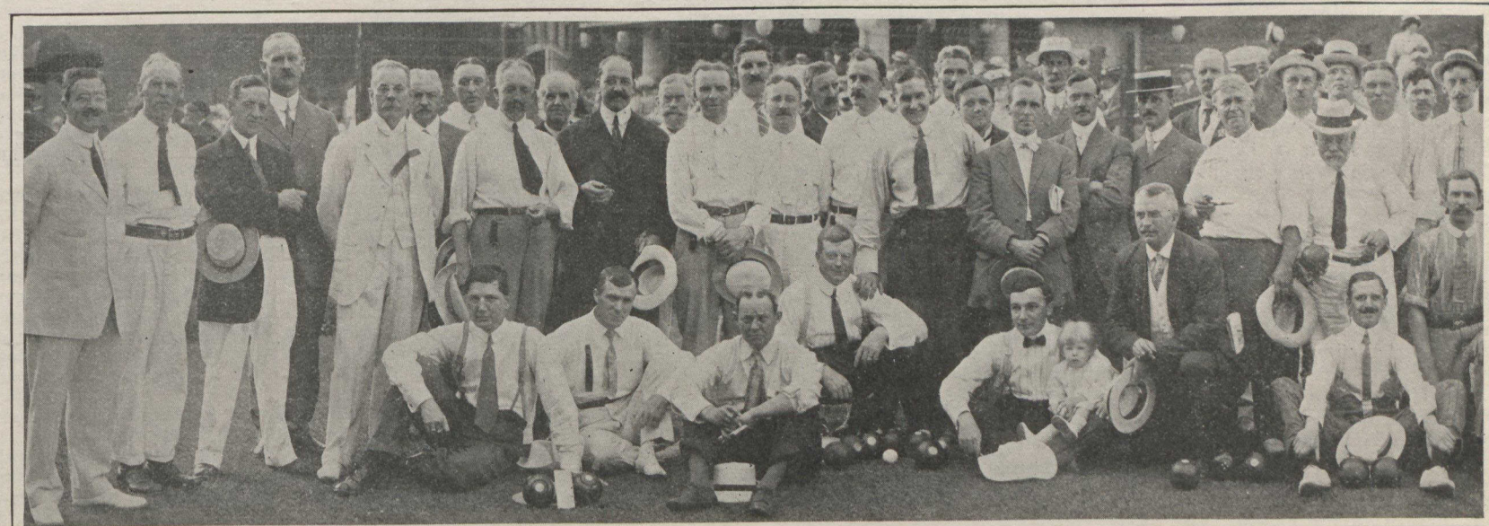
At the close of the tournament all the bowlers, only a part of them are seen in this picture, assembled like members of a family reunion.