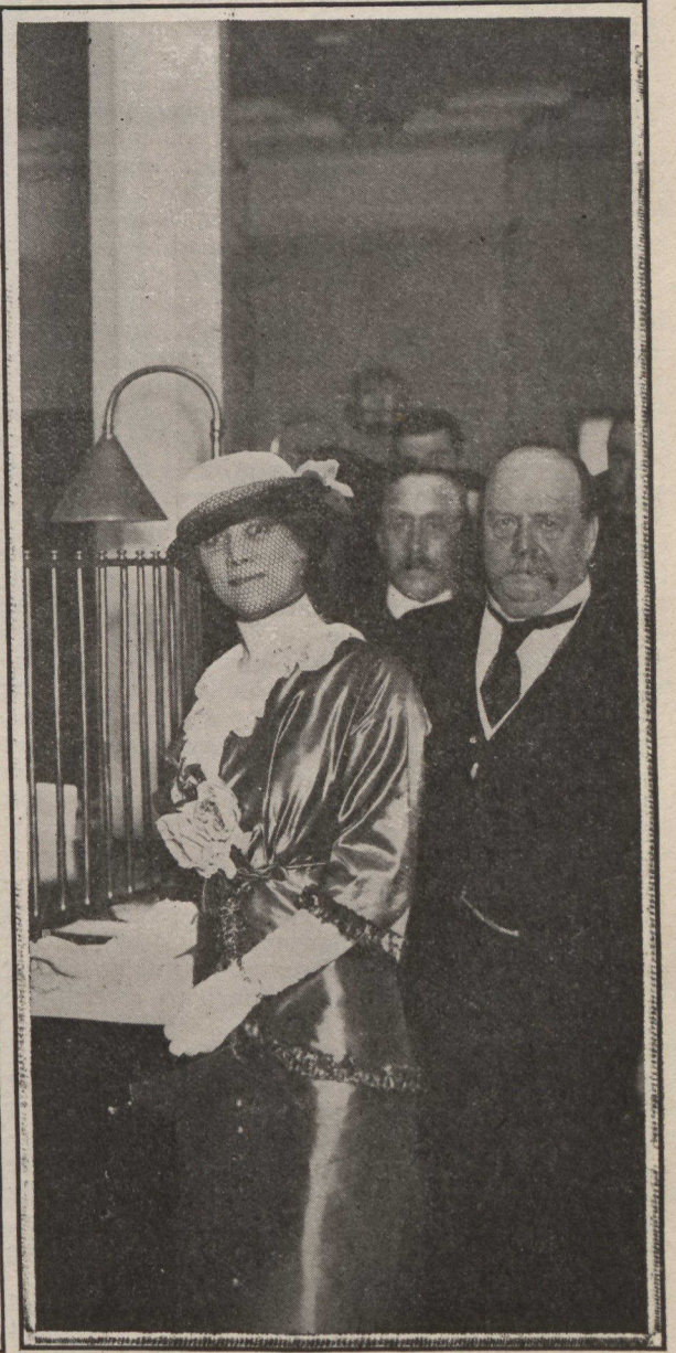
Sir George and Lady Reid Opening a Savings Bank Department in the Commonwealth Bank of Australia's London Office, New Broad Street.