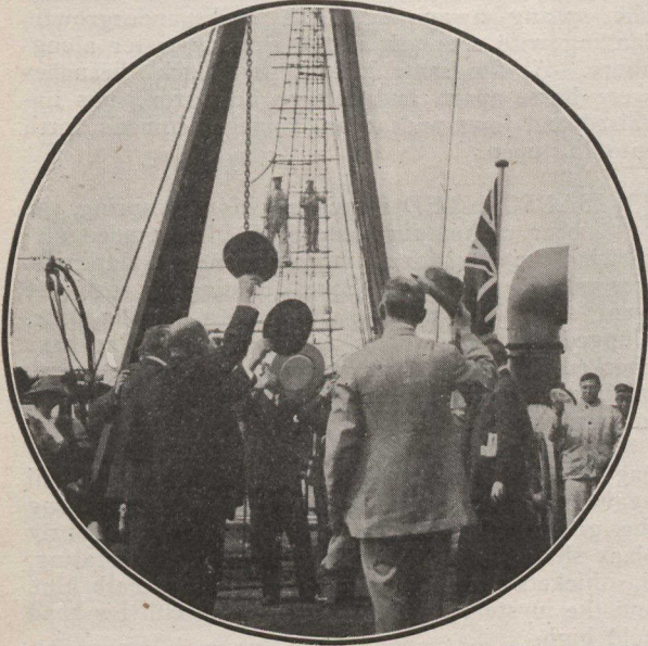
The Canadian Club Presented Stefansson With a Flag at the Esquimalt Navy Yard Before the "Karluk" Sailed. Stefansson is Holding the Flag.