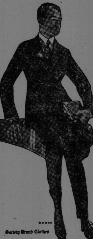
Spring Brand Clothing

Bring your boy down to this store and let him try on some of the Spring and Summer styles.