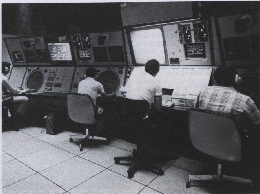
Operators at the console of Montreal's JETS air traffic control centre.

CAE Electronics, founded in 1947, is one of the world's leading advanced-technology companies and one of Canada's largest scientific systems and software houses. The company is based near Montreal's Dorval International Airport, and has an associated firm in Stolberg, West Germany. CAE applies sophisticated real-time computer-based technology to large, complex simulation and control tasks across a broad spectrum that includes commercial and military aviation, hydro and nuclear power generation and transmission, air-space management, marine applications, space exploration, and submarine detection systems. The company's customers include major airlines, aircraft manufacturers, many of the world's defence forces, government agencies, and power utilities. CAE exports 75 per cent of its products and invests approximately 22 per cent of its yearly sales revenue in research and development. CAE has approximately 3 000 employees, over half of whom are engineers, scientists or technicians.