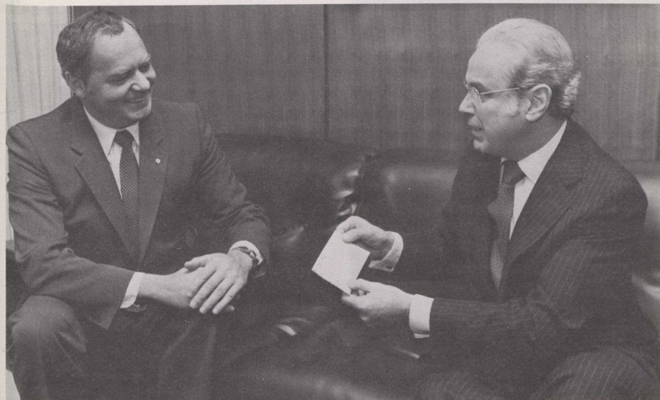
UN Secretary-General Javier Perez de Cuellar (right) receives a cheque for $1 million from Governor General Edward Schreyer for United Nations Children's Fund.

Governor General Edward Schreyer and Mrs. Schreyer were at the United Nations in New York October 22-26 — the first time a Canadian governor general had visited the world body officially.