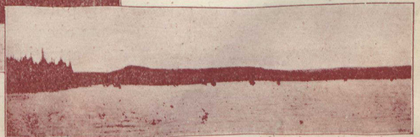
A LAND OF LAKES AND RIVERS.