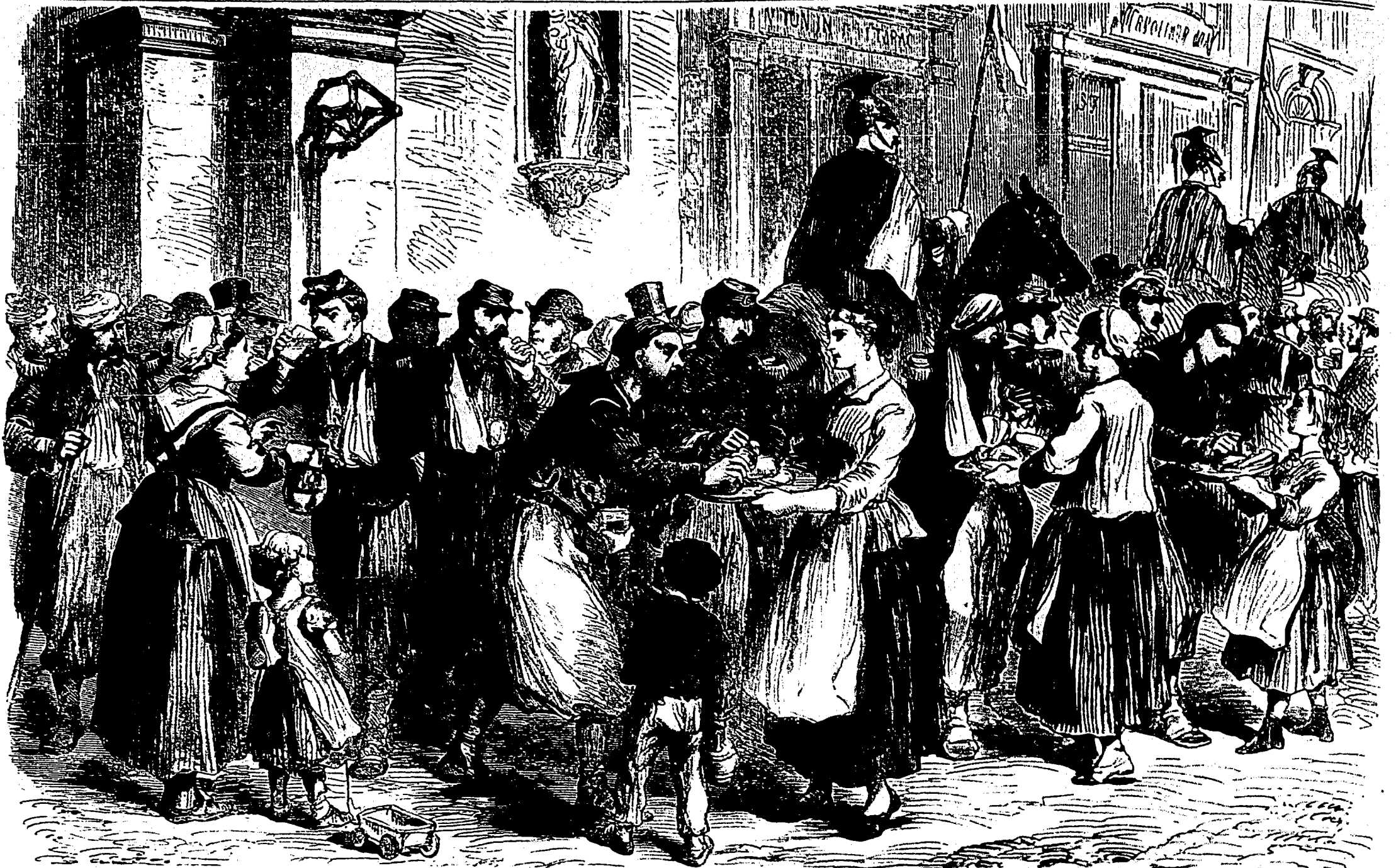
THE WAR-BELGIAN CHARITY TO FRENCH SOLDIERS AT NAMUR.