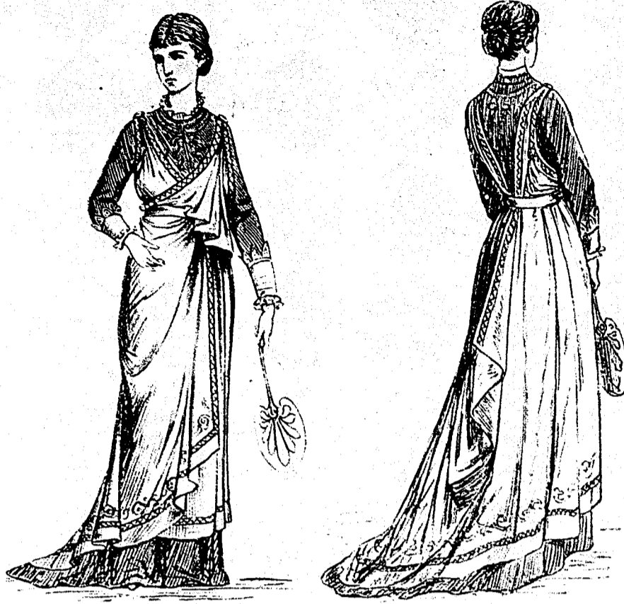
DESIGNS OF THE NEW CLASSIC COSTUME.