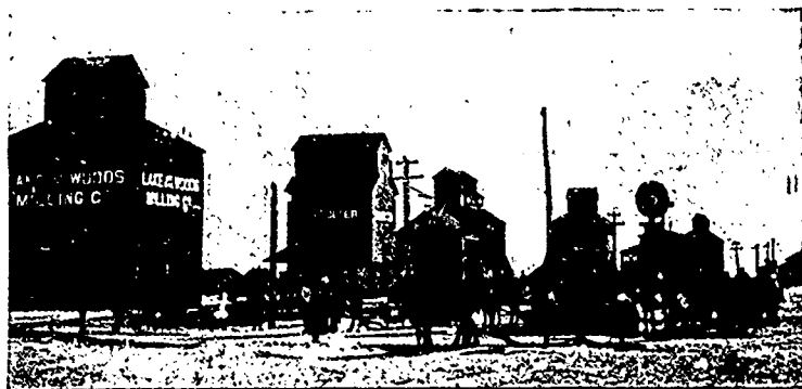
Grain Elevators at Virden, Man.

C. P. R. traffic receipts for the week ending Sept. 21 were $606,000; for the same week last year, $601,000.