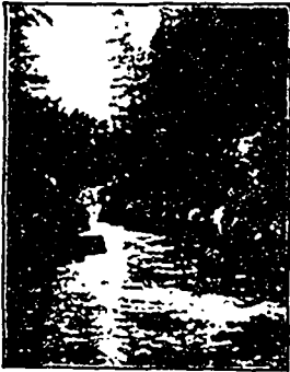
Notch of Devil's River.

States may better sport be found, a more exhilarating air breathed, or such gloriously wild, satisfying, scenery enjoyed.