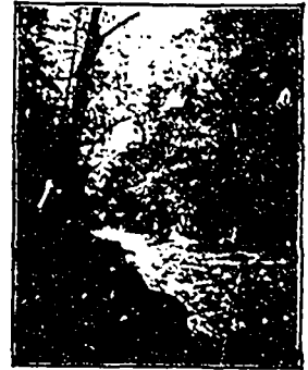
Gorge of the Devil's River.

the delights of a first visit are as yet in store, be assured that nowhere within easy reach of the big cities of the United