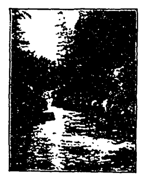
Notch of Devil's River.

States may better sport be found, a more exhilar-