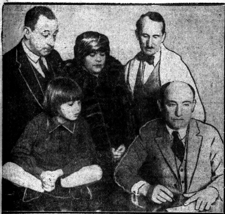
Jackie Coogan, his mother and father (in the white sweater), watching Joseph M. Schenck write a check for $500,000 which Jackie received when he signed his new contract recently.