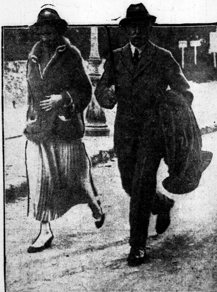
The Duke of Connaught out for a stroll in the south of France.