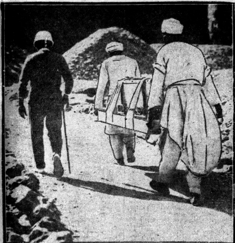
Treasures, 5,000 years old, being carried from the tomb of King Tutankhamen, recently discovered by Lord Carnarvon in Egypt.