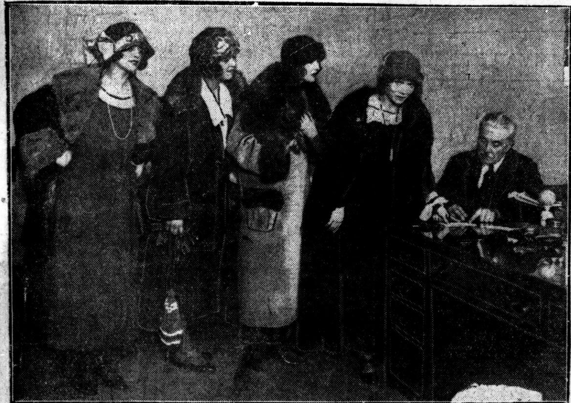
Members of the Ziegfeld chorus are now finger-printed. The prints are compared with those of girls figuring in "wild parties" and if they correspond, the girl and the chorus part company.