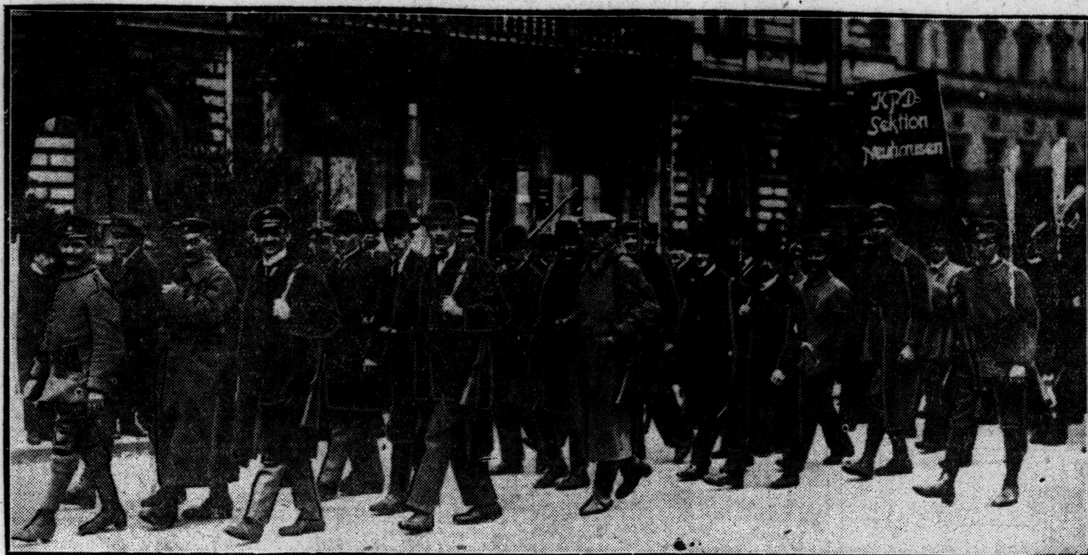
A parade of communists in Germany.