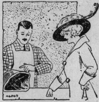
JUST AS YOU WANT

it, we cut the choice meats we offer you. Come in and tell us what you want and how you want it and see how satisfactory