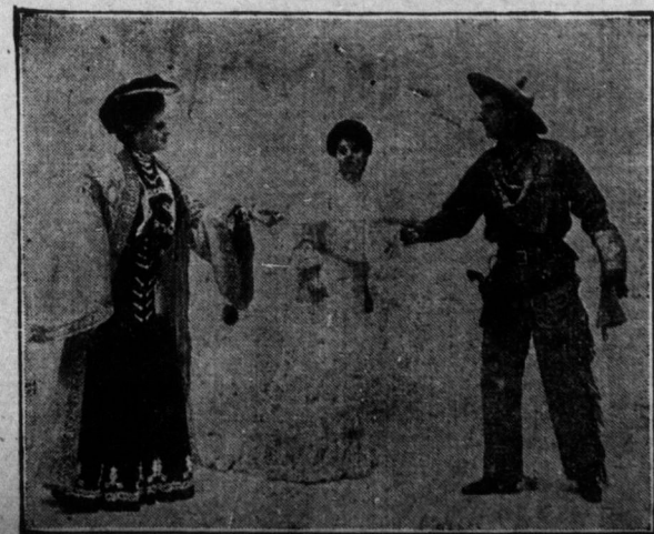
Scene from "Texas," which will be the opening show at the Grand to-morrow night.

Reports from Southwest Texas say many cattle have died from the results of the mosquitoes.