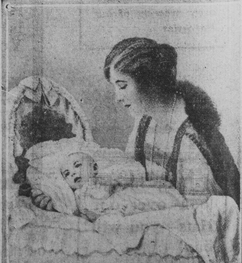
Lady Patricia Ramsay, idolized by the Canadians as "Princess Pat," went to the South of France with her young son after he was christened on February 23.