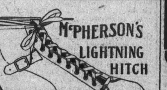
McPHERSON'S LIGHTNING HITCH

For Men at $1.50, $2.00 and $2.50 For Boys at $1.25 and $1.50 For Ladies at $1.50, $2.00 and $2.50 Call for Free Catalogue.