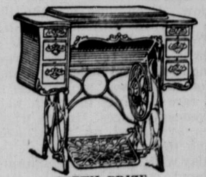
FIFTH PRIZE Famous Singer Sewing Machine