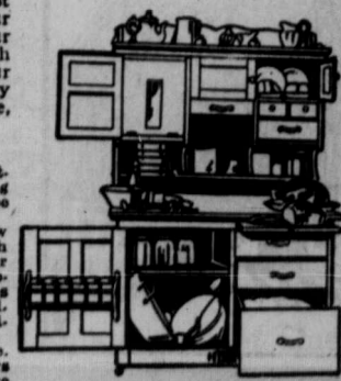
SEVENTH PRIZE Magnificent Ideal Kitchen Cabinet