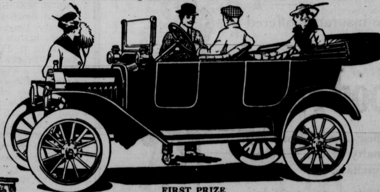
FIRST PRIZE 1916 Five Passenger Ford Touring Car. Value $530.00 Clever Readers of The Grain Growers' Guide