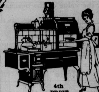
4th PRIZE Clare Bros. Famous High Oven Range