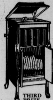
THIRD PRIZE Columbia Cabinet Grafonola