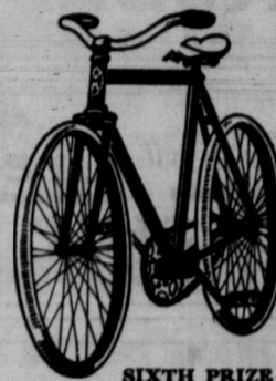
SIXTH PRIZE 1916 Model Cleveland Bicycle