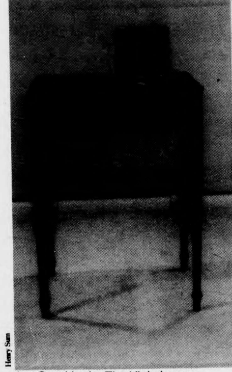
Ian Carr-Harris, The Viola Lesson

Finding the drawer and the ghastly photograph therein, we experience a distasteful kind of complicity. When we look at Balthus' reproduction on the table, we are simply titilated, but when we are confronted with the